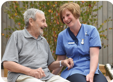
St Michael's cares for over 2,000 patients and their families every year

For every £1 Lottery entry sold, 67p goes directly to patient care, 24p goes towards Lottery Prizes and 9p is spent on administration, promotion of our cause and legal regulation.