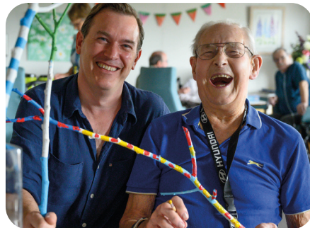
In 2020/21 St Michael's Hospice Lottery raised £322,000